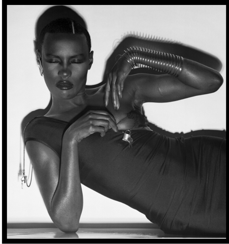
Grace Jones II 1977