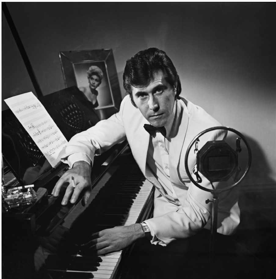
Bryan Ferry 1974