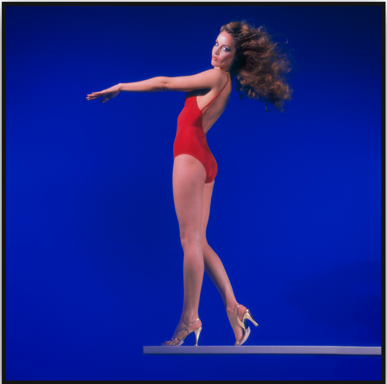
Vogue: Jerry Hall on Board 1976