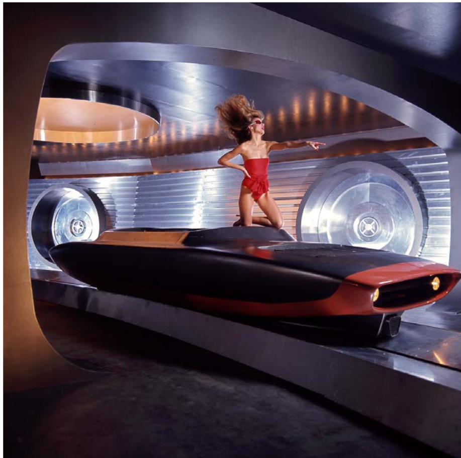
'The Spy Who Loved Me' 1976