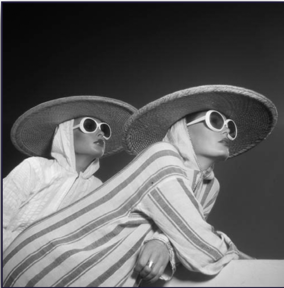
'Girls in Hats & Glasses 1975