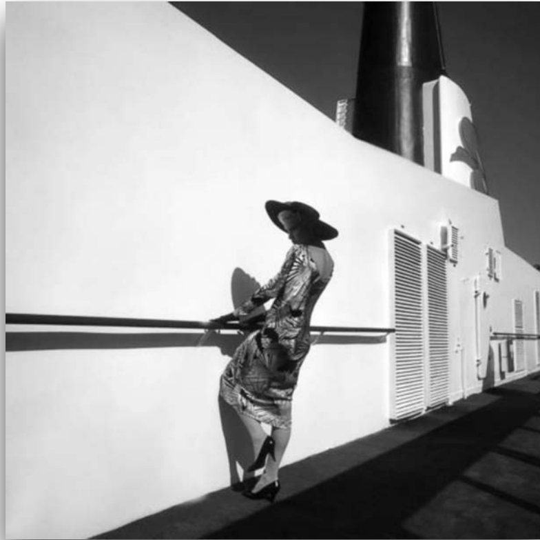
'White Ship' 1984