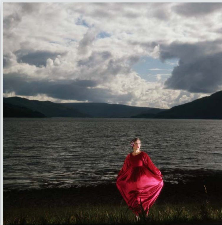
'Girl in a Red Dress by a Loch' 1977