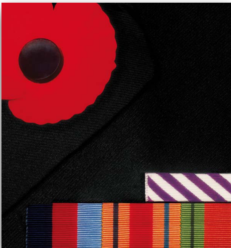
'The Final Cut' 1983