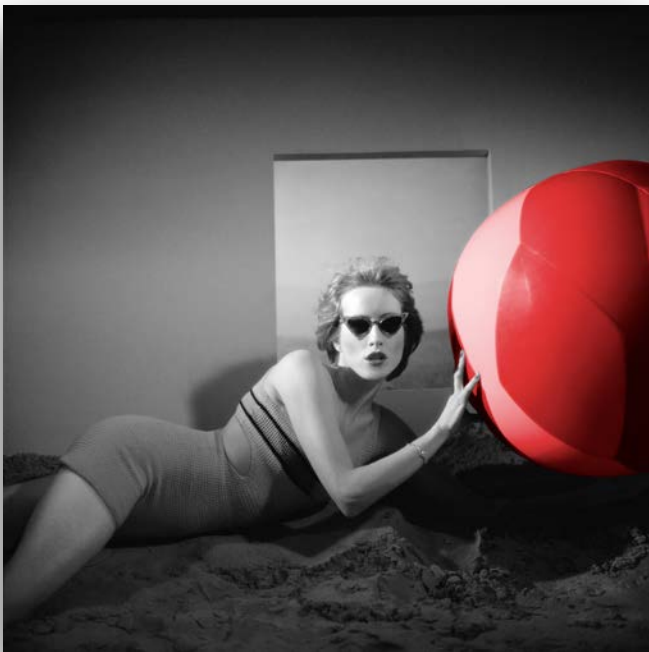
'Girl With a Red Beach Ball' 1974