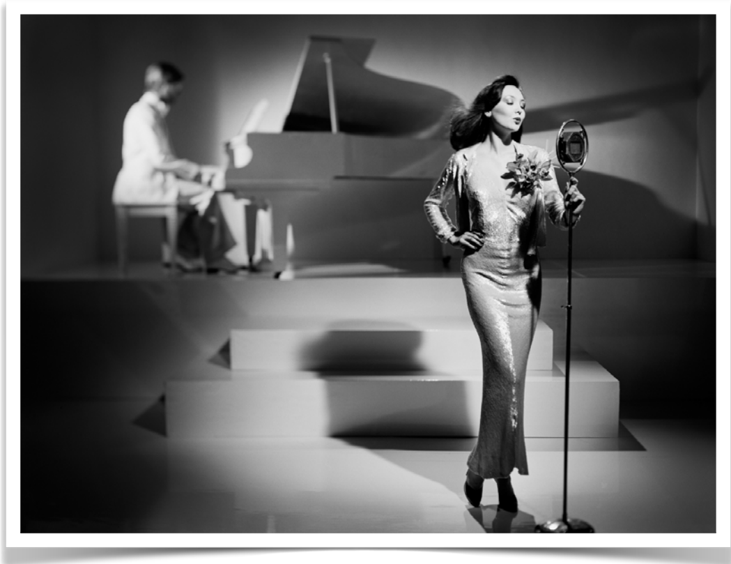
Vogue: 'Singer' 1974